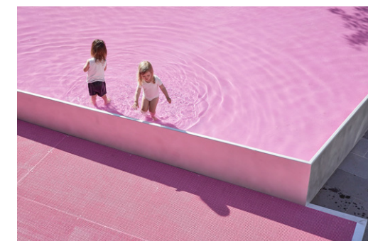
Referencing Australia's pink salt lakes, Pond[er] speaks to the scarcity yet importance of water.